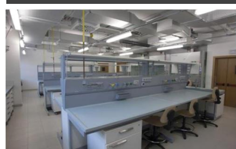
Scientific facilities 15 laboratories, 100 researchers, 7 environmentally controlled chambers.