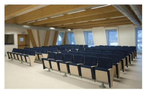
Meeting rooms an Aula Magna – 99-seat auditorium - and 12 training rooms equipped with projectors.