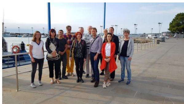
Figure 6 Koper, Slovenia, Kickoff Meeting