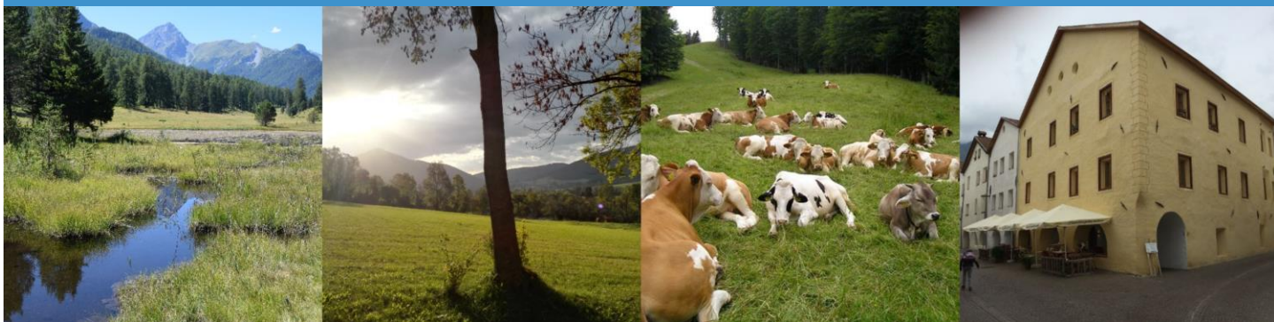
Figure 1 Pilot areas: Tarasp Lai Nair - Switzerland, Lower Austria, Pohorje - Slovenia, Glums - Souty Tyrol

FROM INTELLIGENT LAND USE TO SUSTAINABLE MUNICIPALITIES