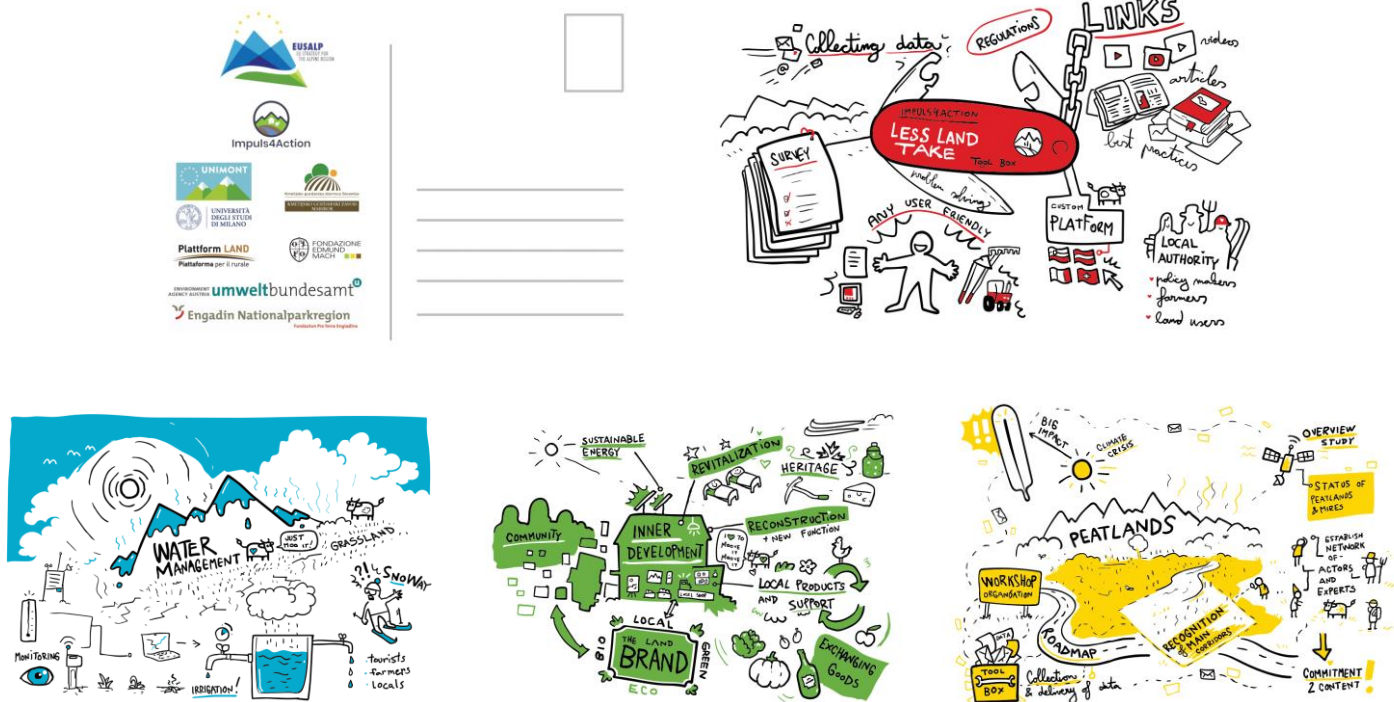
Figure 9 Impuls4Action Postcards

FOR FURTHER INFORMATION ABOUT THE WEBINAR PLEASE FOLLOW THE LINKS BELOW: