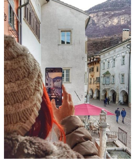
Figure 7 Neumarkt, Italy, by Mojca Hribernik

Till the 2 nd Partner Meeting in Bozen, Italy in February 2020 all partners already started implementing pilot cases through organized workshops on each pilot areas. Next day partners were guests of Mayor of Neumarkt who explained the initiative of the Scattered hotel, started in March 2019, that leads to fewer empty apartments in the historical city.