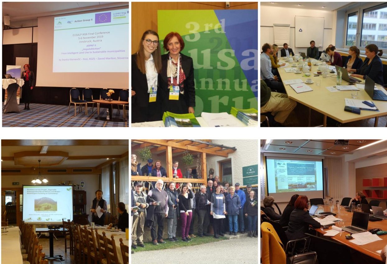
Figure 8 Presentation on EUSALP AG6 Conference, 3 rd ESALP Annual Forum, Workshops, Partners Meeting