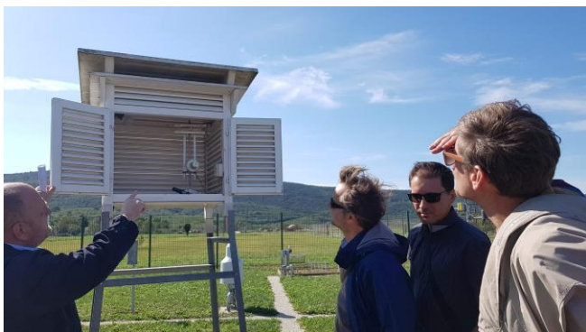
Figure 2 Fruit growing centre Bilje, Slovenia, by Mojca Hribernik

Pilot area Engiadina Bassa in Switzerland collects together with the University Weihenstephan-Triesdorf expert information on the status of peatlands and restoration efforts in all major peatland areas in and around the Alpine arch, develops a draft Action Plan to maintain/restore the peatlands and gets in contact with local actors for a later large scale implementation project.