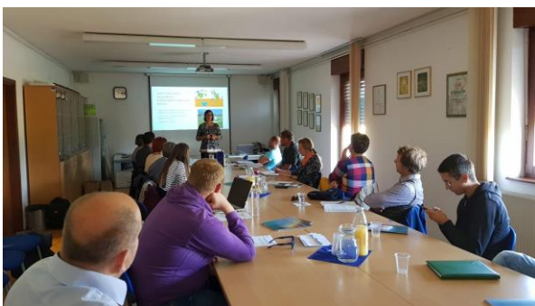
Figure 5 Fruit growing center Bilje, Slovenia, 1st Workshop Water management